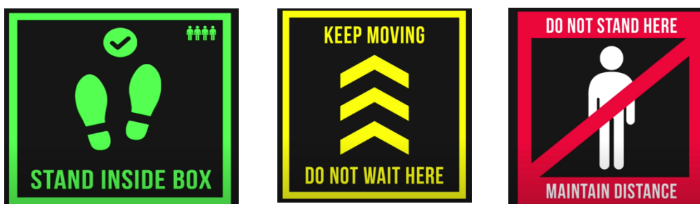
Figure 1 Example Signage